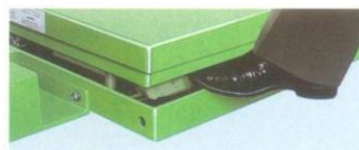
Safety Toe Guard Safety Toe Guard fitted all around platform to stop downward travel of table in the event of an obstruction. (UX Series only)