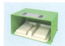
Deadman Remote Control 24V Low Voltage Control with safety cover (UX Series only)