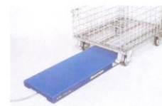
No Pit Applications Ideal for Lifting Wire Basket, etc.