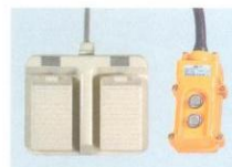
Control Switch Your choice of Foot or Push Button Control