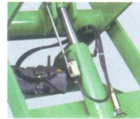
Upper Limit Switch Table stops at any required height NX, X and 2X Series - Option Ux Series - Standard