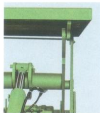
Safety Clearance More than 30mm scissor leg clearance for safety (Except 2X series)