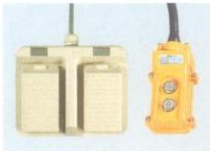
Control Switch Your choice of Foot or Push Button Control