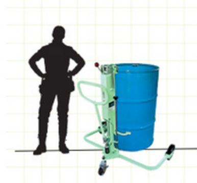
• Dimension DL-250 & DL-350

* All specifications are subject to change without prior notice. Optional for different drum sizes (upon request)