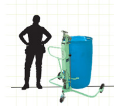
• Dimension DL-250MD & DL-350MD