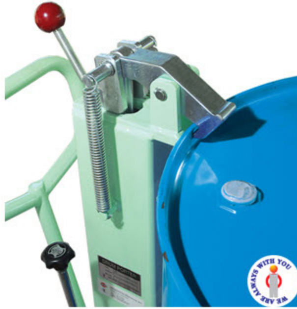
DL-250 &amp; DL-350