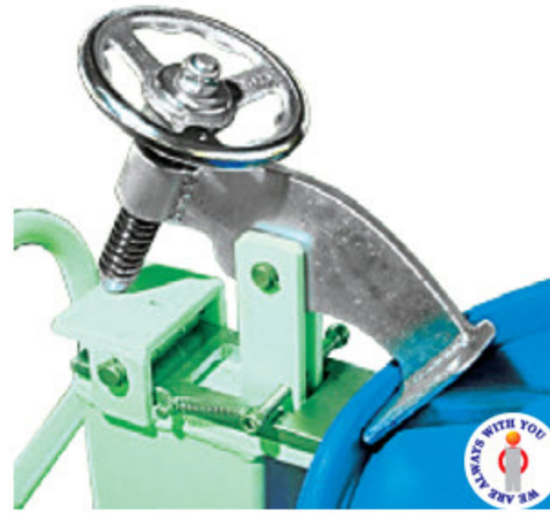
DL-250MD &amp; DL-350MD